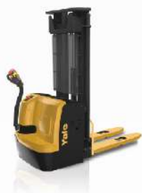
Walkie Stacker MS15UX 1,500kg