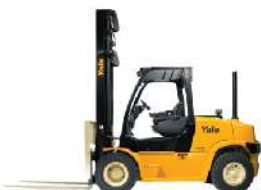
GP135-155VX 6,000 - 7,000kg