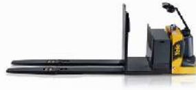
Low Level Order Picker MPC 060-080-VG 2,700 - 3,600kg