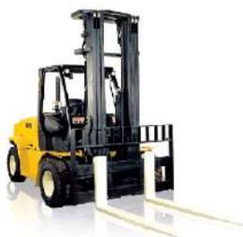
GP170-190VX 8,000 - 9,000kg