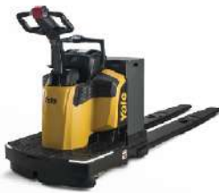
Rider Pallet MPE060-080VH 2,700 - 3,600kg