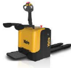
Rider Pallet MP20XUX 2,000kg