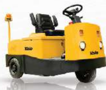
Sit-Down MT60UX 6,000kg