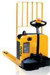
Walkie MPW060-080E 2,700 - 3,600kg