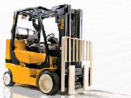
GC080-120VX 3,600 - 5,450kg