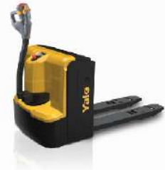
Walkie MP20KUX 2,000kg