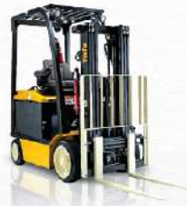
4 Wheel ERC045-070VG 2,000 - 3,150kg