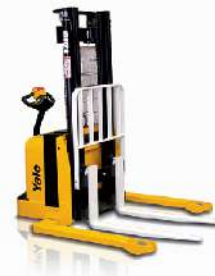
Walkie Straddle Stacker MSW025-030F, MSW040E 1,100 - 1,800kg