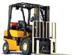
GP20-35VX 2,000 - 3,500kg