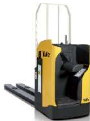
Encloser Rider Pallet MP20-25T 2,000 - 2,500kg