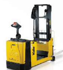
Walkie CB Stacker MC10-15 1,000 - 1,500kg