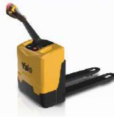
Walkie MP20UX 2,000kg