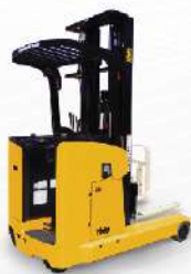
Stand-Up Moving Mast FBR13-18S(W)Z, FBR20-30SZ* 1,250 - 3,000kg