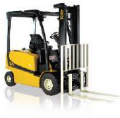
4 Wheel ERP22-35VL 2,200 - 3,500kg