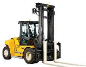
GDP80-160DF/EF 8,000 - 16,000kg