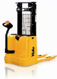
Walkie Stacker MS10-20 1,000 - 2,000kg