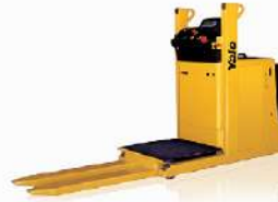
Low/Mid Order Picker MO10E AC 1,000kg