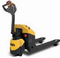
Walkie MP15UX 1,500kg