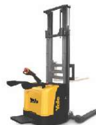
Rider Straddle Stacker MSL15XUX 1,500kg