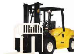
GP50-70UX6 5,000 - 7,000kg