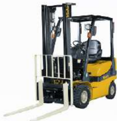
GP16-20SVX 1,600 - 2,000kg