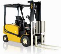
4 Wheel ERP16-20VF/ ERP030-040VF 1,600 - 2,000kg