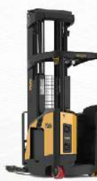
Stand-Up Moving Single Double Reach NR/NDR030-045EC, NR/NDR030-040DC 1,360 - 2,041kg