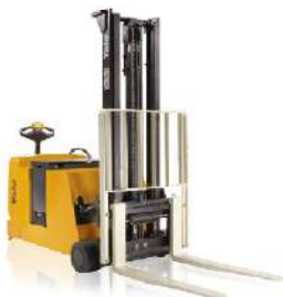
Walkie CB Stacker MCW025-040E 1,100 - 1,800kg