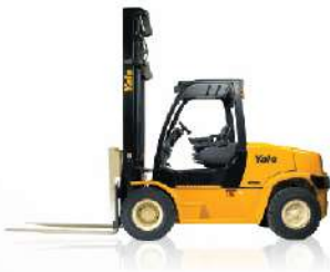
4 Wheel ERP70-90VNL 7,000 - 9,000kg