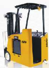
3 Wheel Stand-Up ESC030-040AD 1,350 - 1,800kg