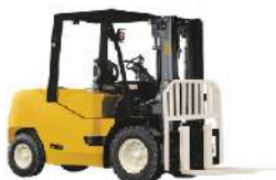
GP40-50UX 4,000 - 5,000kg