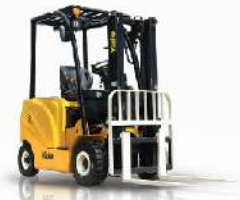
4 Wheel ERP15-35UX 1,500 - 3,500kg