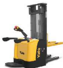
Rider Stacker MS15XUX 1,500kg