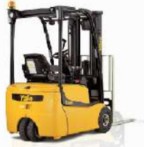
3 Wheel ERP16-20VT/ ERP030-040VT 1,600 - 2,000kg