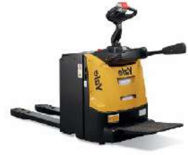
Rider Pallet MP20X 2,000kg