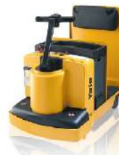
Stand-Up MTR005-007-F 4,500-6,800kg