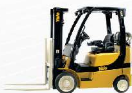
GC040-070VX 2,000 - 3,500kg