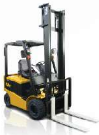
4 Wheel FB15-35RZ 1,500 - 3,500kg