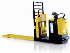
Low Level Order Picker MO20-25 2,000 - 2,500kg