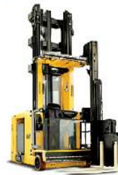
Man-Up Turret Truck MTC10-15L 1,000 - 1,500kg