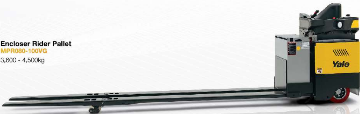
Encloser Rider Pallet MPR080-100VG 3,600 - 4,500kg