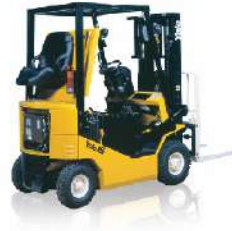
4 Wheel FB35-40PYE 3,500 - 4,000kg