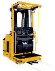
Mid-High Order Picker OS030EF/BF, SS030BF, FS030BF 1,350kg