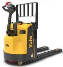
Walkie MPB045VG 2,000kg