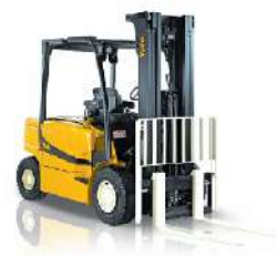
4 Wheel ERP40-55VM 4,000 - 5,500kg