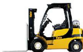
GP40-55VX 4,000 - 5,500kg