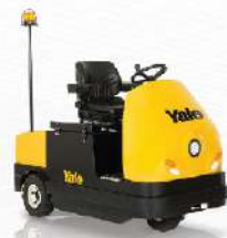
Sit-Down MT70-80 7,000 - 8,000kg