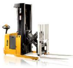
Walkie Reach Stacker MRW020-030E 900 - 1,350kg