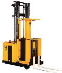
Mid-High Order Picker MO10S 1,000kg