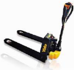
Walkie MPC15 1,500kg