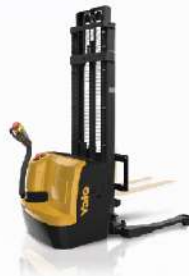
Walkie Straddle Stacker MSL15WUX 1,500kg