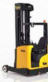
Sit-Down Moving Mast MR10-14E, MR14-25 1,000 - 2,500kg