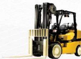
GC135-155VX 6,000 - 7,000kg