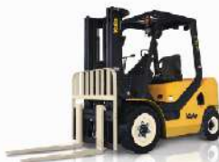
GP20-35UX 2,000 - 3,500kg