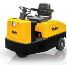
Sit-Down MT30UX 3,000kg