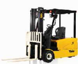
3 Wheel ERP16-20UXT 1,600 - 2,000kg