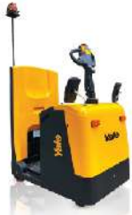
Stand-Up MT30XUX 3,000kg