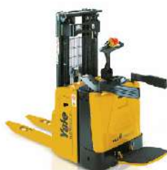
Rider Stacker MS12-15X/XIL 1,200 - 1,500kg