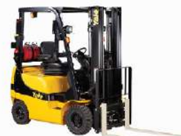
GP20-35MX 2,000 - 3,500kg