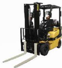
GP15-20SMX 1,500 - 2,000kg