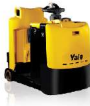
Stand-Up MO50T, MO70T 5,000 - 7,000kg