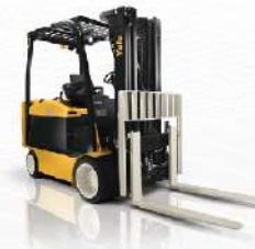
4 Wheel ERC080-120VH 3,600 - 5,400kg